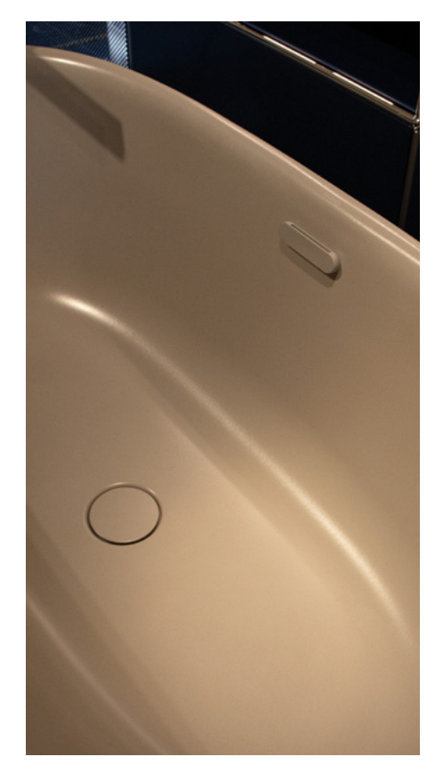
THE INTERIOR SHAPE OFFERS OPTIMAL LYING COMFORT ALSO WHEN TWO PEOPLE TAKE A BATH TOGETHER WITH TWO IDENTICAL BACKREST SLOPES AND A CENTRALLY POSITIONED DRAIN.